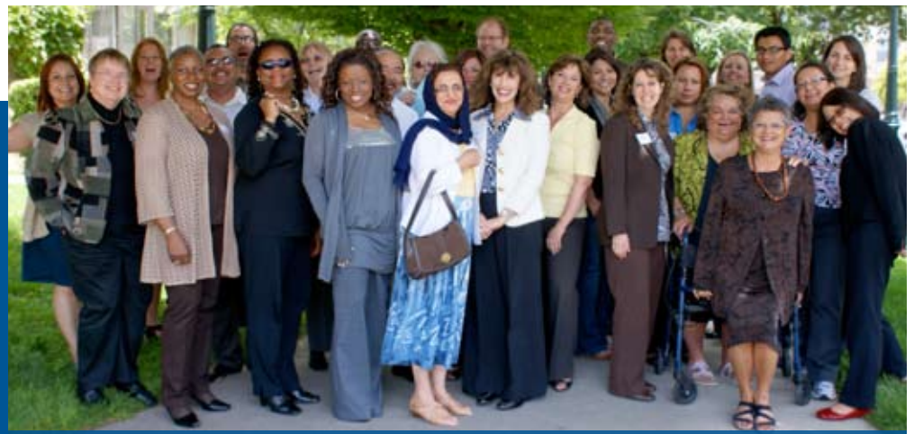
CCP college counselors, faculty, and staff at a June work session